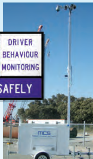
Mobile CCTV unit.

Typical road sign advising drivers they are being monitored for safety.